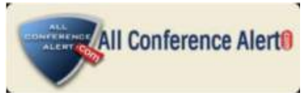
All Conference Alert