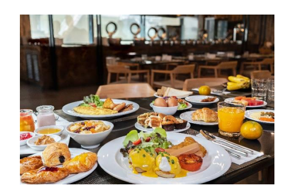
Premier Lounge Breakfast

Enjoy a premium experience at Premier Lounge.