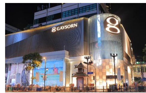
Gaysorn Village 850 m | 13 minutes