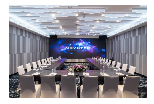
Double your rewards

Enjoy a premium experience at Premier Lounge.