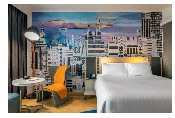
Complimentary room Upgrade

Members of ALL Meeting Planner earn 2X Reward points for events.