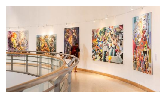
Bangkok Art & Culture Center