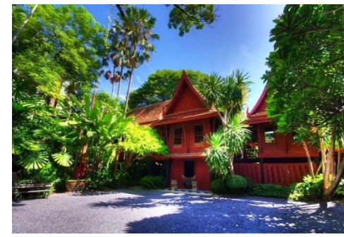
Jim Thompson House 1.3 km | 20 minutes