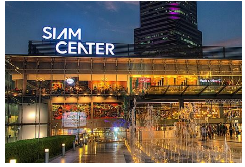
Siam Center 350 m | 5 minutes