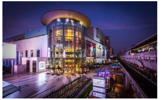
Siam Paragon 300 m | 4 minutes