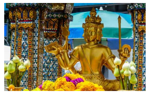
Erawan Shrine 750 m | 11 minutes